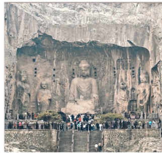
龙门石窟 Longmen Grottoes