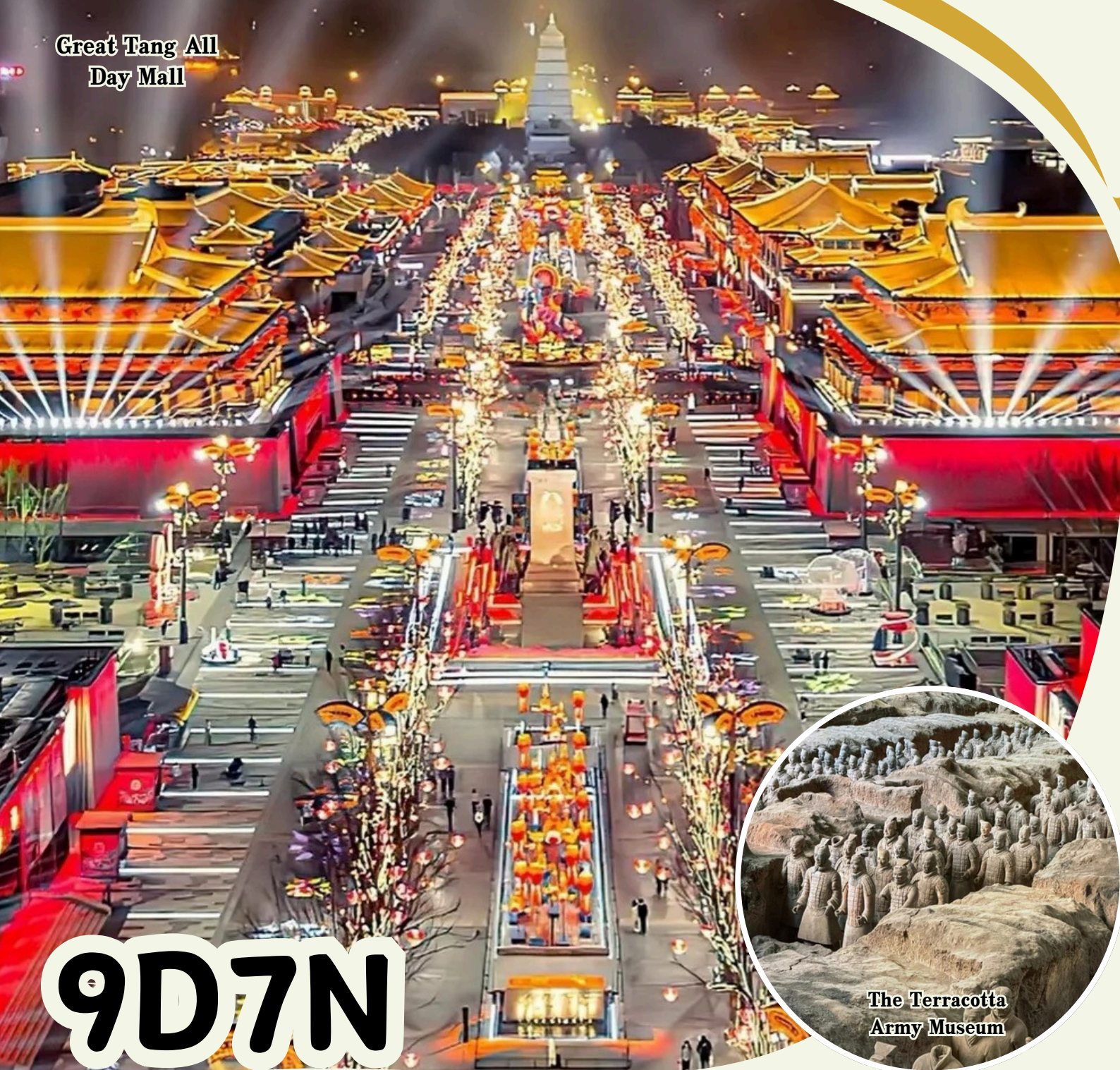
The Terracotta Army Museum