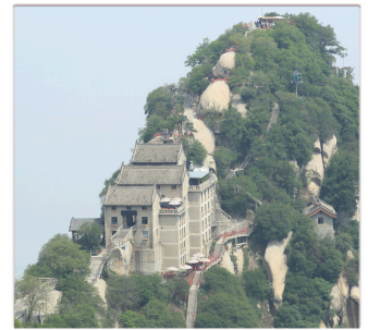
华山风景区 Huashan Scenic Area