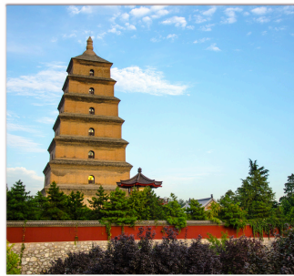
小雁塔 Small Wild Goose Pagoda