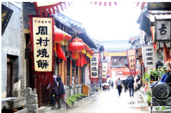
Zhoucun Old Town , under the administration of Zibo City of Shandong Province, holds the reputation as the "birthplace of Shandong commerce."

Known as the "dry port" for its strategic location along many overland trading routes, trade in Zhoucun flourished in the early 20th century, and it became an important center for bankers and well as silk and tobacco merchants.